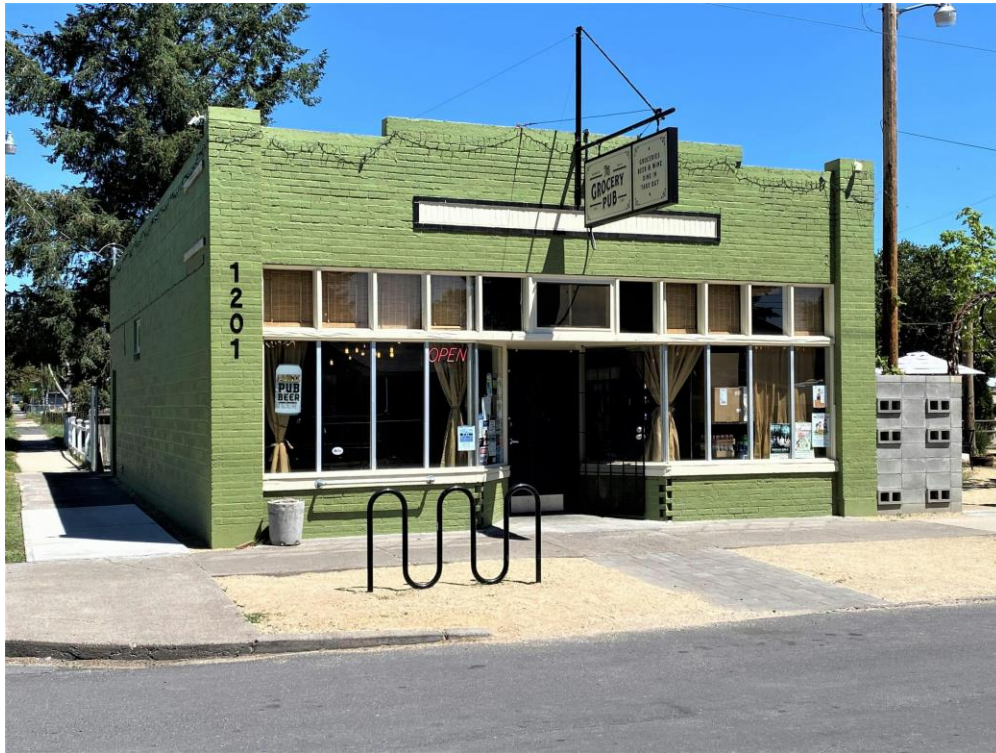
Our New Home: 1201 Division Street Klamath Falls Oregon